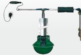
SELF-REGULATING HEATING STRIP