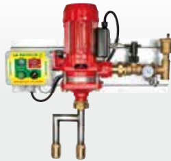
SPEED-FLOW (see diagram 2)