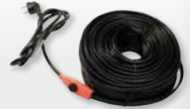
READY TO CONNECT HEATING CABLE