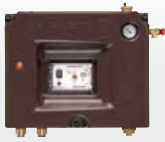
PROFLOW II (see diagram 1)