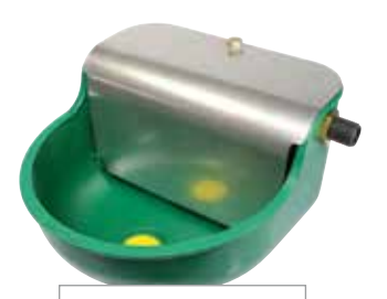
Ref 2015. BABYLAC cast iron drinker with constant level. Retail price excl. VAT 48 €

With its small bowl made of cast iron, BABYLAC is particularly suitable for sheep and goats from a very early age on, but also for young calves. As it is impossible to nibble on it, this drinker is also very convenient for dogs.